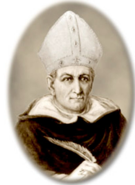
Albertus Magnus (1193-1280)

TRADITIONAL LATIN MASS MARCH 7 TH , 2010 THIRD SUNDAY OF LENT